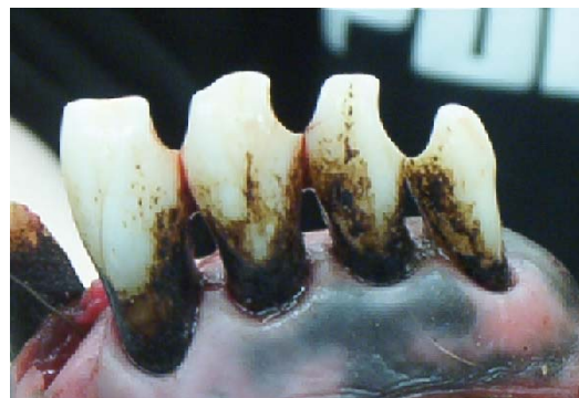
Fig.4. Incisor teeth (labial view) with smooth labial and lingual surface enamel and distinct interproximal U-shaped wear in moose from the Tanana Flats, Alaska, 2002.

Seventy-four percent of the examined jaws exhibited signs of osteoporosis of the mandibular bone. Osteoporotic circular skull-lesions and periodontal lesions associated with molars have been previously reported in moose on Isle Royale (Hindelang and Peterson 1993, 1996, 2000). Osteoporotic lesions were absent in Isle Royale moose younger than 7 years, but increased with age. Males in that study had a higher prevalence of lesions than