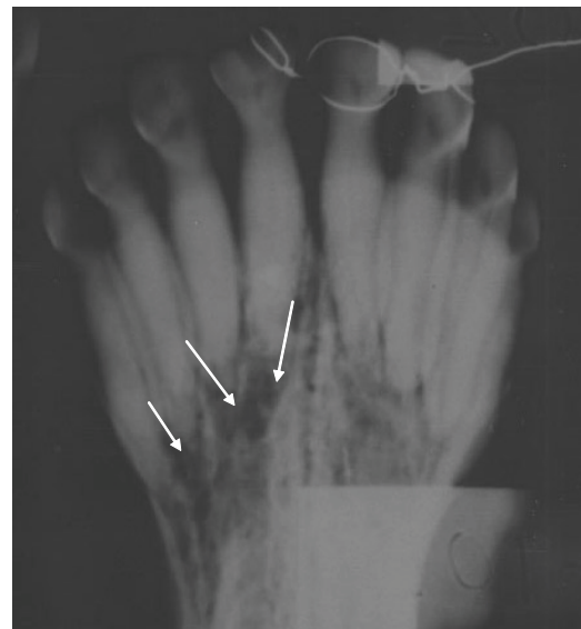
Fig.2. Radiographic example of several periodontal lesions (arrows L: Incisor 1, 2, and 3) in moose on the Seward Peninsula, Alaska, 2002.

moose from Kalgin Island are characterized by smooth labial and lingual surface enamel with even wear on all incisors (Fig. 3), while incisors from Tanana Flats are characterized by smooth labial and lingual surface enamel with marked interproximal U-shaped wear (Fig. 4.); lingual-labial surface fracture lines are singular and vertically oriented. Tooth conditions similar to moose from the Tanana