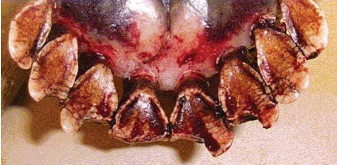
Fig.1. Incisor teeth (lingual view) with lingual-labial enamel fracture lines extending netlike over the entire crown surface and individual irregularly shaped teeth with sharp angles and contours in a young adult moose on the Seward Peninsula, Alaska, 2000. The mean tooth wear score ( \pm SE) for this animal is 2.25 \pm 0.73 .

indicates a young population with animals > 7 years old missing, suggesting decreased survivorship of older animals. Over the last 10 years (1991-2001), percentage of harvested prime moose has decreased by about half while percentage of harvested young adult moose has increased (Maier, unpublished data), lending support to this hypothesis. Mean, incisor-arcade width for adult males was 5.75 \pm 0.04 cm and fell within the lower range of reported values for Alaskan moose (5.7 – 6.1 cm; Spaeth et al. 2001). Yearlings had significantly smaller incisor width than did adults. A similar finding was demonstrated by Spaeth et al. (2001) where the incisor-arcade width increases with age and finally stabilizes in both sexes of Alaskan moose at their ultimate size. Arcade width in moose is strongly correlated to body mass; we hypothesize that the small body size probably reflects the predominantly young age distribution in the 2002 harvest, although reduction in body size and low recruitment are well-known density-related trade-offs in moose populations (Ferguson et al. 2000). The small body size of moose in our study may be due to density dependence, although the moose population on the Seward