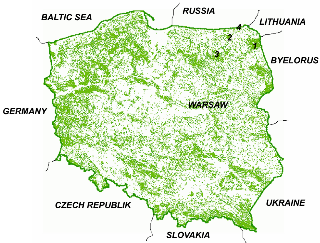
Fig. 1. Moose study areas in northeast Poland during 1998-2002. 1 – Augustowska Forest, 2 – Borecka Forest, 3 – Piska Forest, 4 – Romincka Forest.

the animals' escape. After the observers had completed their search, 2 pairs of trackers retraced their path around the perimeter of the plot, recording all new tracks left by moose entering or leaving the plot, along with the location and the number of tracks.